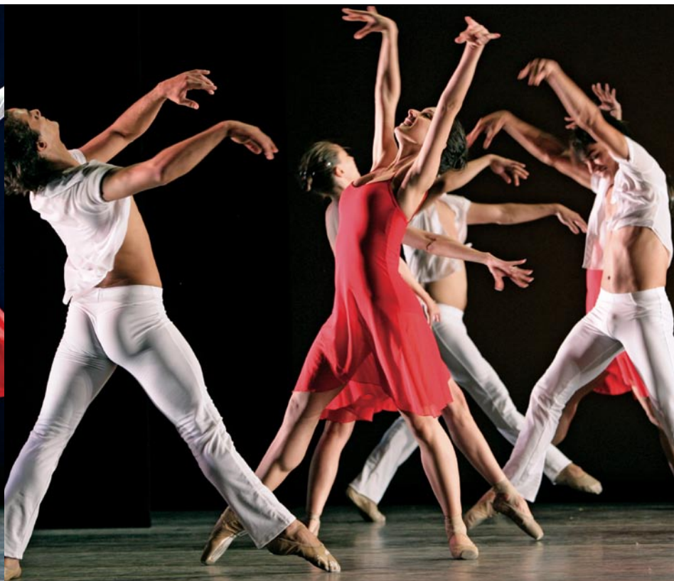
Ballet de Monterrey